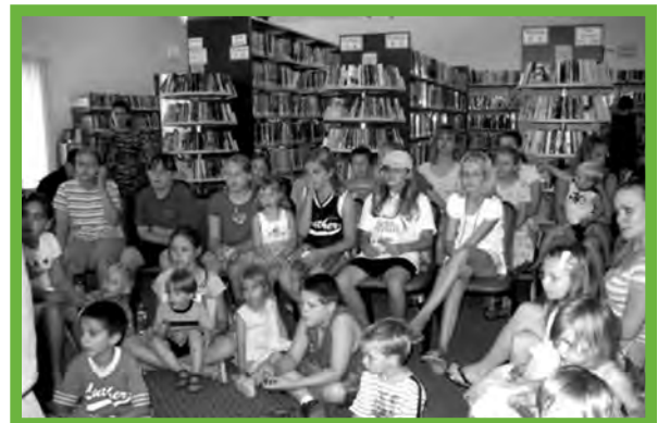
Summer 2008: Story Hour

This endowment was given a unique opportunity to grow because of a challenge grant from the DQF Foundation to LCCF. Letters were sent out and our grass roots effort to raise the necessary funds began. Friends and neighbors joined the effort, and within a few short weeks, we were able to raise enough money to establish an endowment. With DQF's match, we are now at $9,000!